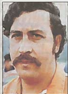
TREASURE: Pablo Escobar