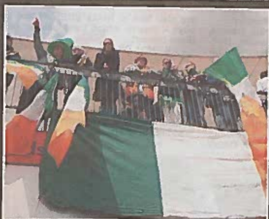
SUPPORT: Irish fans drown out the noise of the engines