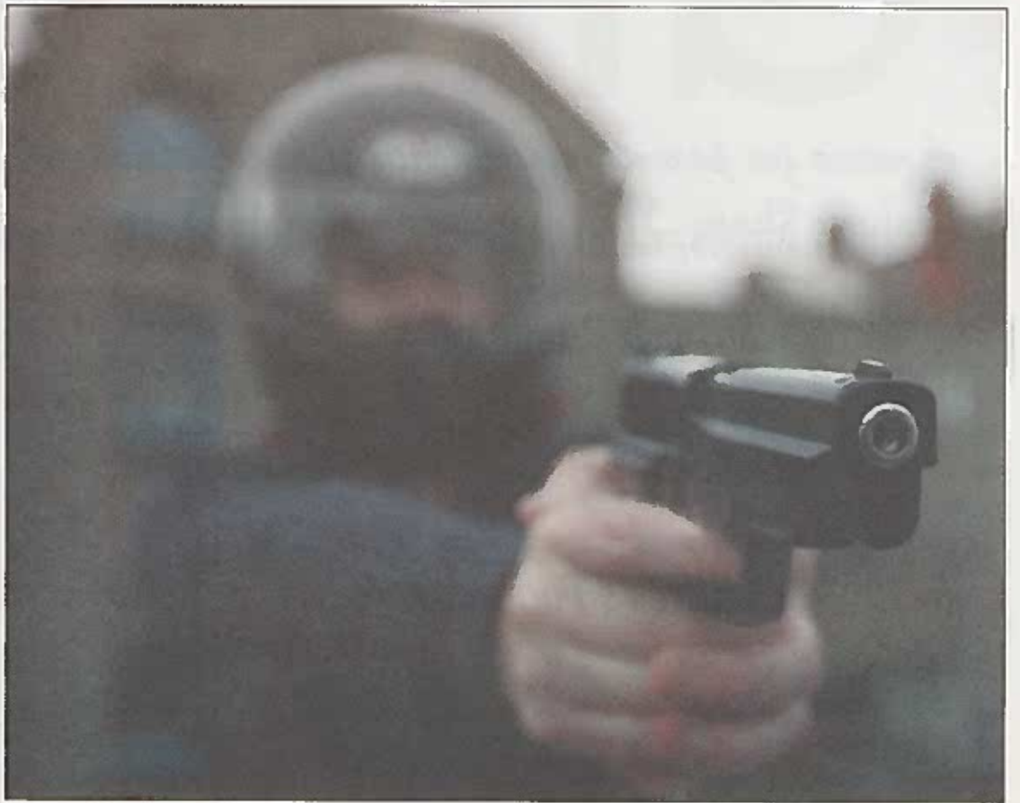
Three men were shot in two separate incidents in Drimnagh and Kimmage last week

"It's dangerous on the town at night when they're