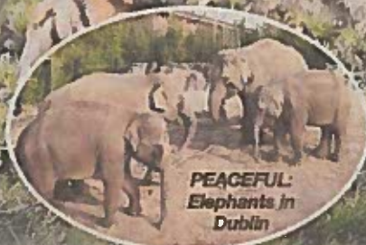
PEACEFUL: Elephants in Dublin