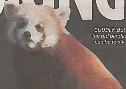
CUDDLY. But the red pandas can be feisty