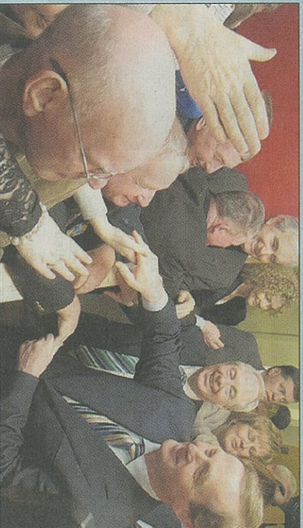
MAN OF THE PEOPLE: Ecstatic crowds greet Enda Kenny in Castlebar last night