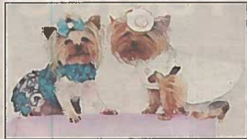
NEW LEASH OF LIFE: Pampered pooches on big day

Abbey's bridal dress, as well as the groom's tux