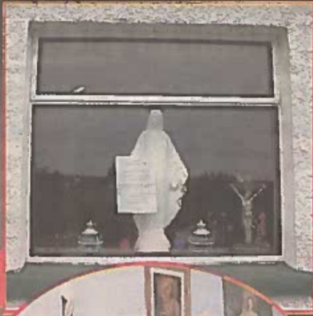
SHRINE OF THE TIMES: Pilgrims are now being asked for donations at the Donegal site