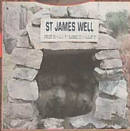
ALL'S WELL: Now everything costs money at shrine