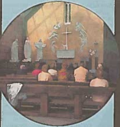
PRAYER: Pilgrims in Knock

Sceptics say that the latest 'vision' in Rathkeale and the one at Ballinspittle have this in common: both happened during a deep economic recession.