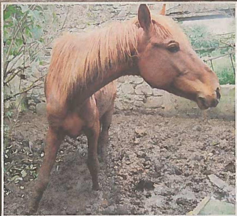
STARVING: This unfortunate horse was abandoned in saturated ground