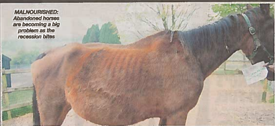
MALNOURISHED: Abandoned horses are becoming a big problem as the recession bites