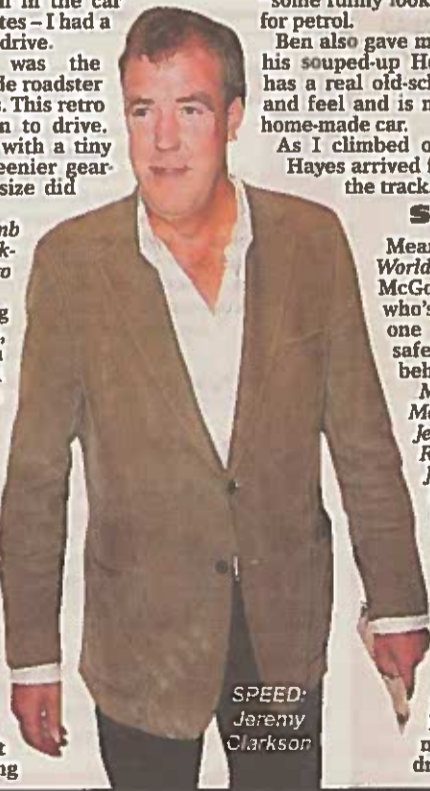
SPEED: Jeremy Clarkson

So it was just as well we hadn't put it on - we were travelling