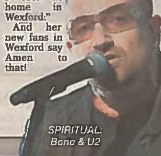
SPIRITUAL: Bano & U2

And her new fans in Wexford say Amen to that!