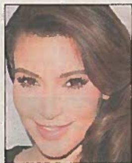
SNACK: Kim Kardashian