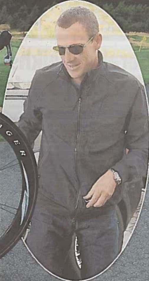
MAIN ATTRACTION: Tour de France legend Lance Armstrong