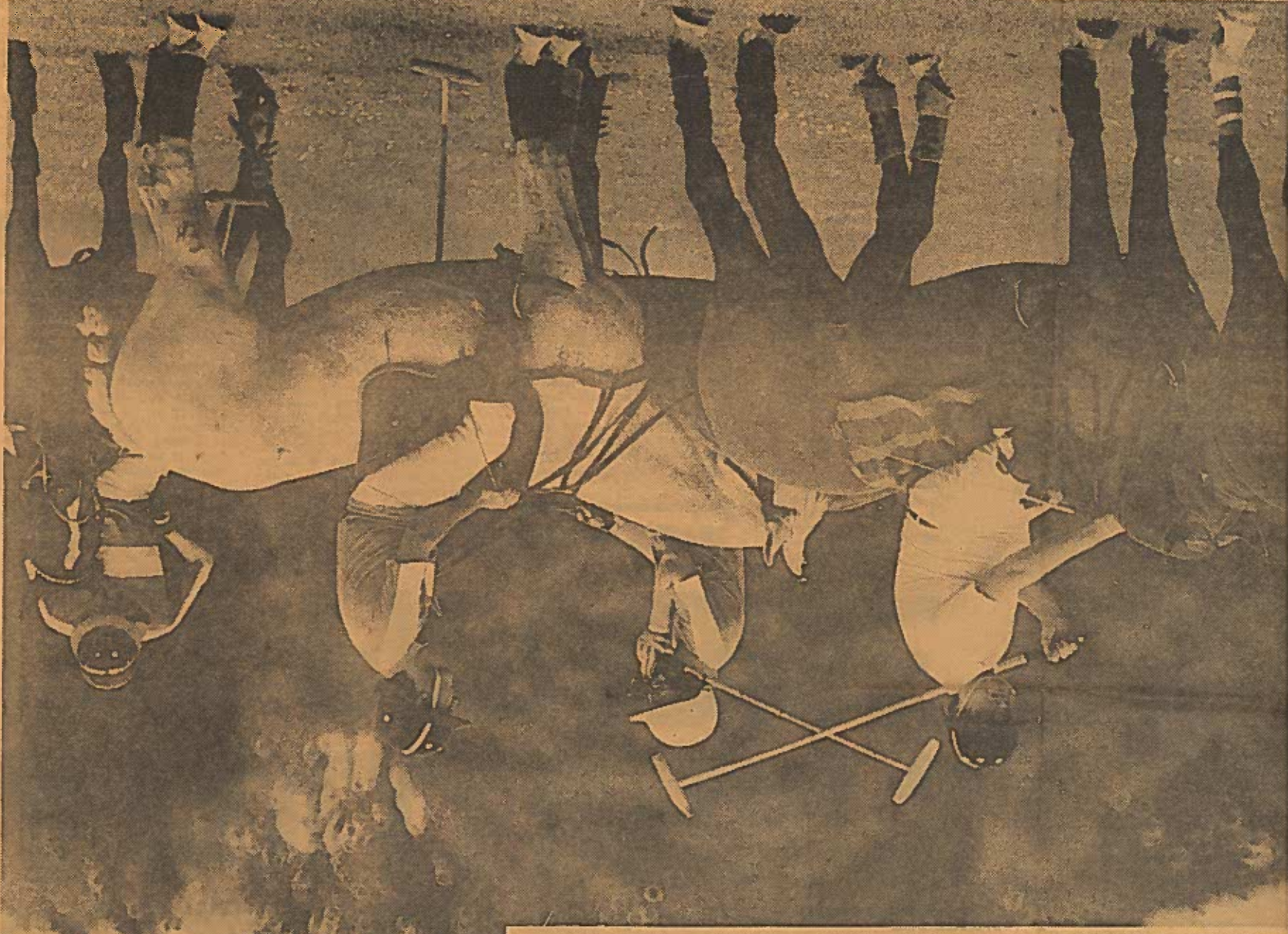
A break from the action in the President's Cup at the Phoenix Park.