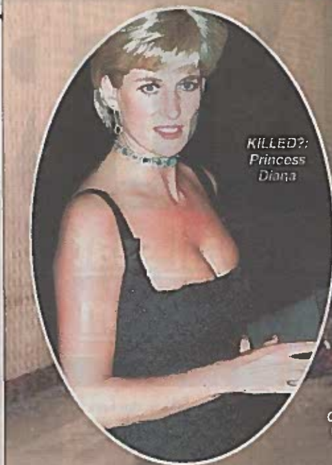
KILLED?: Princess Diana