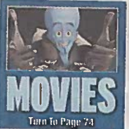
Turn To Page 74