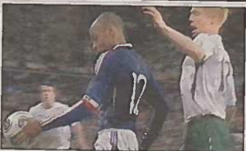
SHAME: Henry's actions tainted the beautiful game

My Facebook page has crashed several times under