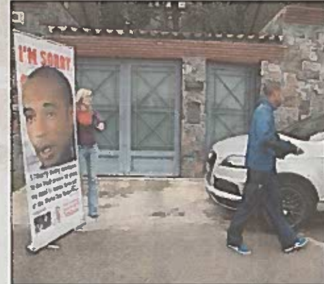
COWARD: The French star just turns away